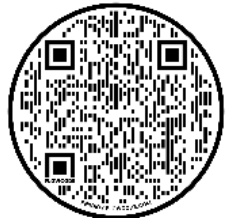
QR Code 2