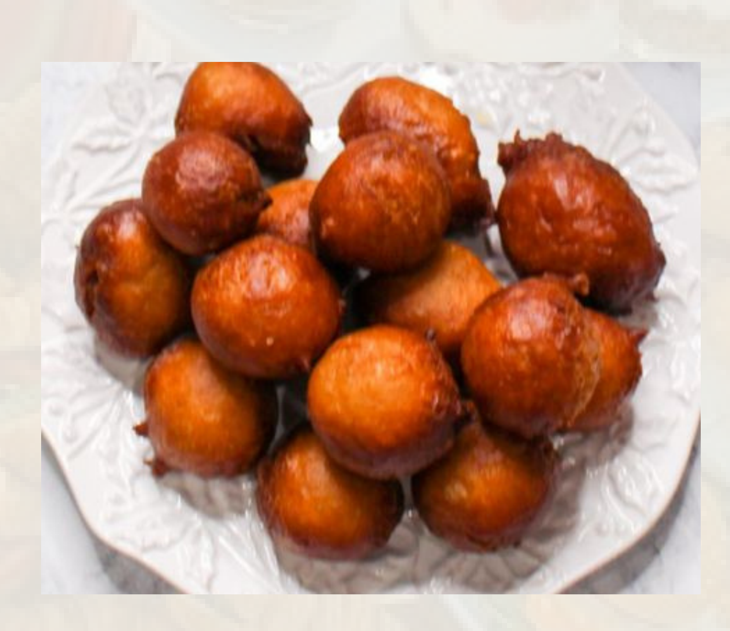
BOFORTIS BREAKFAST FOOD, SNACK AND DESSERT. IT IS ESSENTIALLY A FRIED YEASTED WET DOUGH