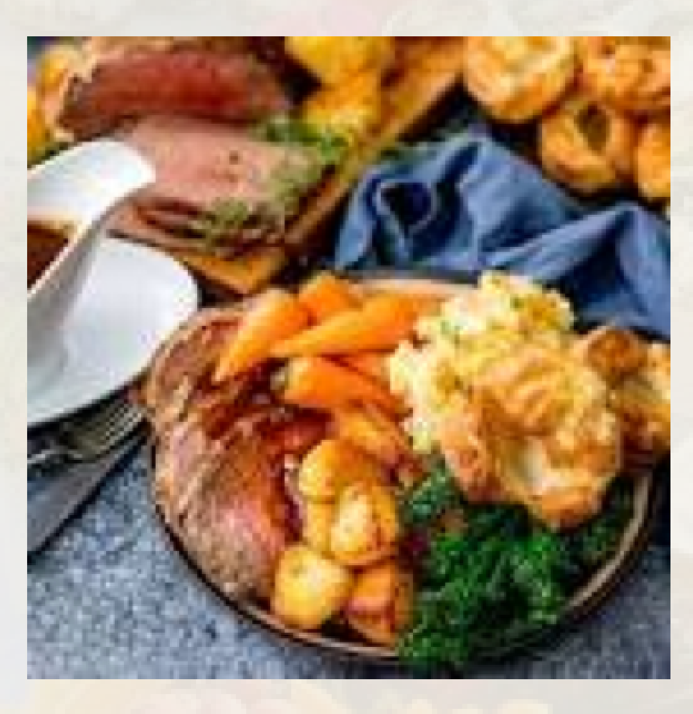
ROAST DINNER WHICH IS ANY DIFFERENT MEAT, ROAST POTATOES, VEGETABLES, GRAVY AND A YORKSHIRE PUDDING.