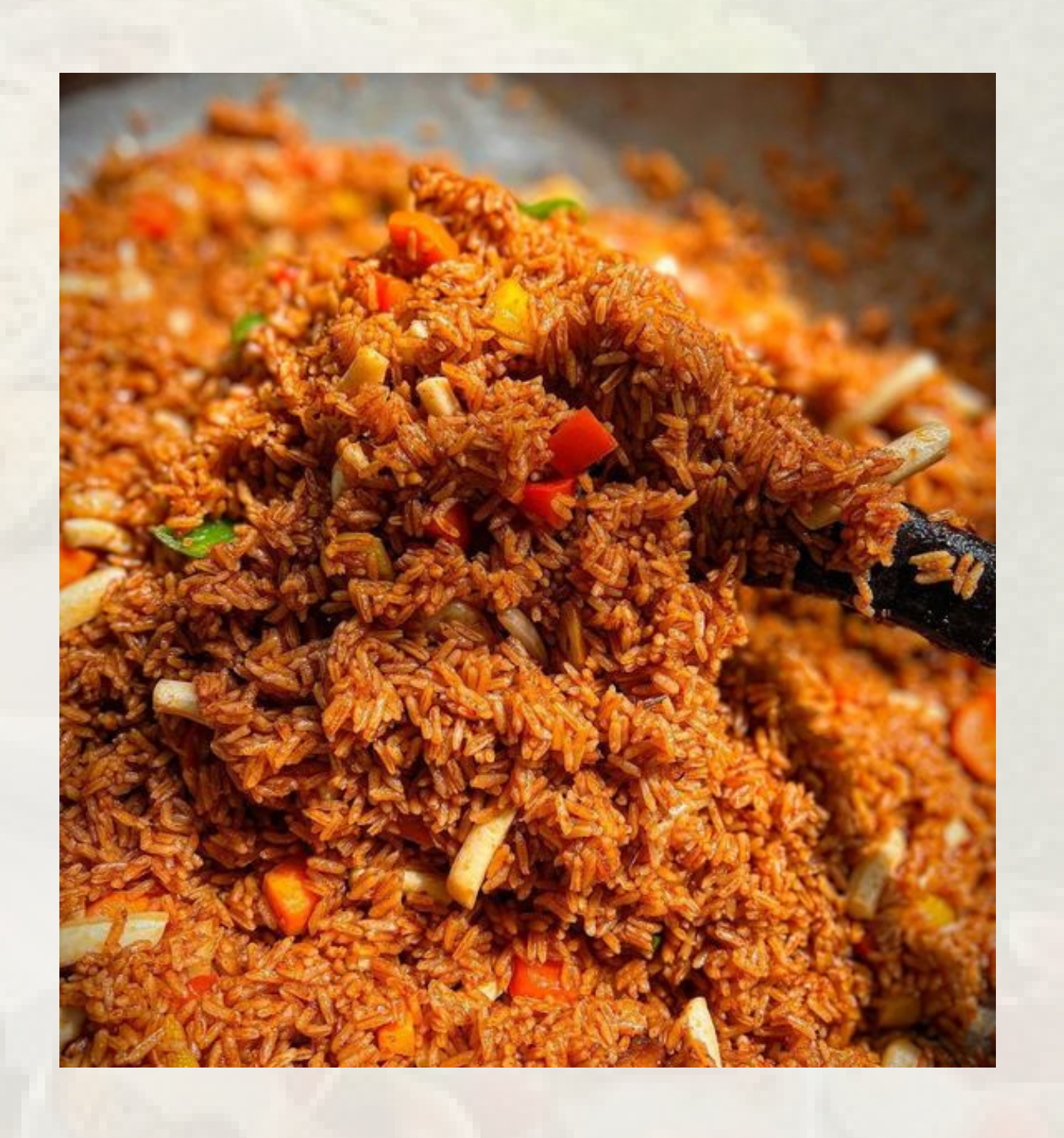
JOLLOF RICE WHICH IS RICE WITH SAUCE WHICH CAN HAVE VEGETABLES